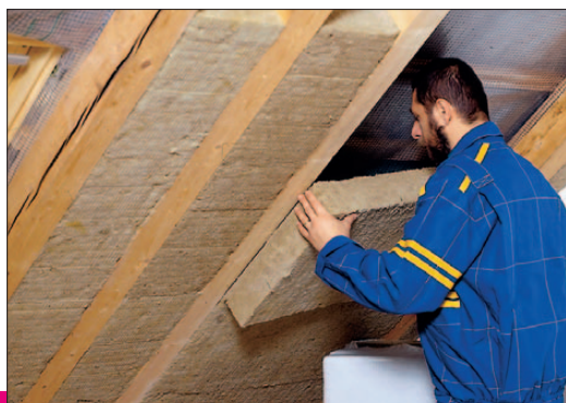
Example of product application ISOVER Uni

7) FU = functional unit (1 m 2 of insulation by 100 mm thick for live cycle phases A1-A3).